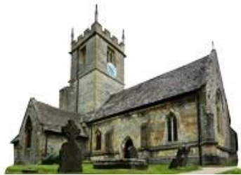
Hampton – Fairfield – Thistledown Eastwick Park – Charity Crescent